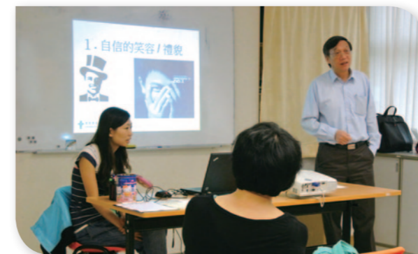
退休專業人員(右)於求職講座上分享心得。 Auxiliary Professional (right) shared his experience in job interview workshop.

Tsui Ping Community Service continued to develop the Employment Support Service in last year, which achieved remarkable results. Not only the number of participating companies, variety of the companies, applicants and successful rate of job matching were increased; the service also attracted applicants with medium to high education levels. Through 'Careers Consultation' from our experienced Auxiliary Professional, the applicants were able to find suitable jobs. In addition, social workers helped explore the applicants' other personal and family needs, and then provided comprehensive social service support.