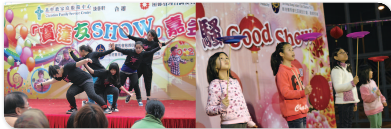
寶達「動感90後」 Youngsters in Motion - Potat Community Project

Our Jockey Club Youth Leap (Integrated Children & Youth Services Centre), School Social Work Service and YOU CAN - Potential Exploration Unit have adopted 'community-based', 'school-based' and 'project-based' as their respective service position. Jockey Club Youth Leap continued to build up cooperated network with local stakeholders so as to approach wide range of young people. Meanwhile, the School Social Work Service continued developing specific counselling programmes to address students' needs. And, YOU CAN - Potential Exploration Unit did make every endeavour to create art and sports / adventure-based projects with an aim of energising our youth work intervention. All these strategies were echoing with the 2 main work focuses of the youth service continuum, 'promoting positive youth development' and 'encouraging young people to participate in social affairs'.