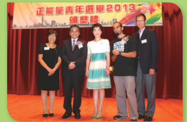
「正能量青年選舉2013」主禮嘉賓合照。 'Positive Youth Award 2013' - Group photos of the officiating guests.

此外，YOU CAN – 潛能發展中心亦透過參與「共創成長路賽馬會社區青少年培育計劃」，在觀塘、黃大仙及西貢區推行名為「天天Teen晴正向成長訓練計劃」。計劃以正向心理學為理論基礎，配合表達藝術及歷奇介入手法，協助初中生發掘個人強項，並鼓勵他們從生活裡發掘感恩的事，及學習建立積極的生活態度，從而掌握快樂生活的鑰匙。