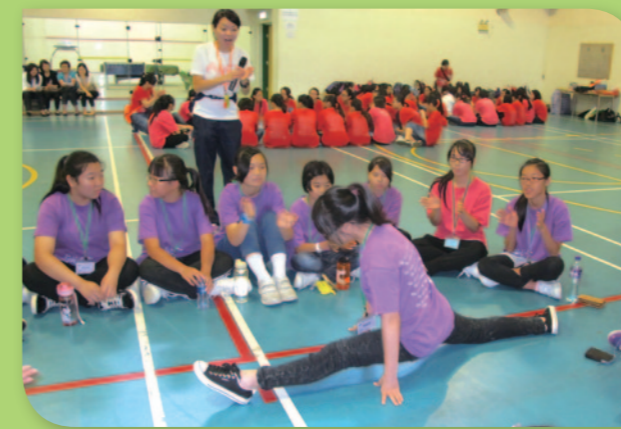
「共創成長路賽馬會社區青少年培育計劃」為同學以多元活動形式進行第一層課堂教育。 'PATHS to Adulthood - a Jockey Club Youth Enhancement Scheme for Community' provided a variety of activities for students in the first lesson.

All of us would have different interpretation of 'Happiness'. The 'Positive Youth Award 2013', an election launched by our Integrated Youth Service, has defined 'Happiness' as 'Engaged Life' in order to educate young people the key elements of joyful life. This year, we received 125 nominations from more than 20 secondary schools in Kwun Tong District. Nearly all candidates had their engaged activities, such as rock climbing, dancing, playing snooker, bowling, jogging, etc. They attended 2 rounds of interview and shared their stories to the vetting committee. The principle of the award was to remind young people the importance of creating engaged life even under the internet boom. We hope the 'Positive Youth Award' would one day become a platform for recognising young people. Eventually, the culture of encouraging youth positive development would be further spread over in the community.