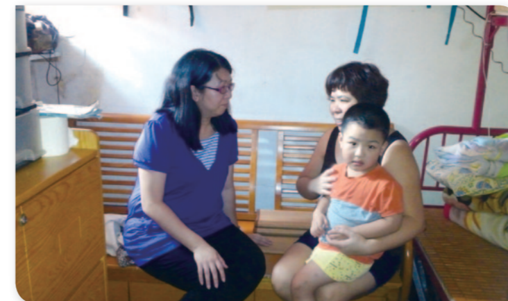
社工透過探訪，了解劏房戶的情況。 Social worker visited people living in sub-divided flat to understand their needs and problems.

We further formed a concern group named 'Platform Concerning Sub-divided Flats Issues in Hong Kong' (the Platform) with social workers and academics from different organisations. The Platform strived for the improvement of current housing policies by arousing public concern and discussion. Moreover, the Platform worked out a list of suggestions on advancing the long-term, mid-term and short-term housing policies and exchanged views with members of Long Term Housing Strategy Steering Committee individually. Last but not the least, in October and November 2012, the Platform conducted a survey to estimate the number of SDF in Hong Kong by inspecting more than 4,000 flats in buildings older than 30 years. The result of this survey successfully drew wide media coverage.