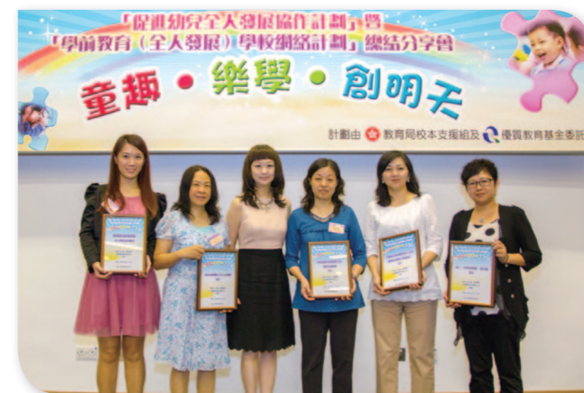
德田幼稚園完成校本支援計劃，並在總結分享會上獲頒發證書。 Tak Tin Kindergarten completed the School-based Support Scheme.

On the other hand, Tak Tin Kindergarten has joined the scheme run by the Faculty of Education Centre for University and School Partnership of the Chinese University of Hong Kong. This scheme was subsidised by the Quality Education Fund with aims to improve leadership role of the principal in curriculum development and expand the teaching strategies of teachers through the professional support of the University. After 10 months of training, the teaching skills of our teachers have improved significantly. As a result, our children became attentive in class. Their capabilities in observation, creative thinking, expressiveness and self-confidence were all strengthened.