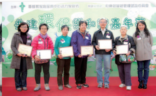
和樂邨屋邨管理委員會委員應邀擔任「共建環保和諧嘉年華」主禮嘉賓。 Wo Lok Estate Management Advisory Committee members were invited as the officiating guests of the Fun Fair in Wo Lok Estate.