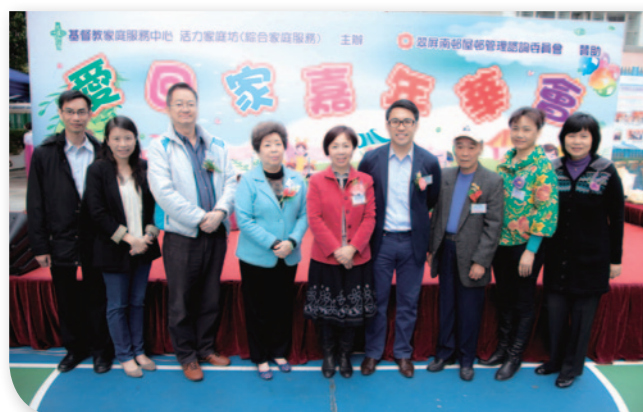
翠屏(南)邨屋邨管理委員會委員應邀擔任「愛回家嘉年華會」主禮嘉賓。 Tsui Ping (South) Estate Management Advisory Committee members were invited as the officiating guests of the Fun Fair in Tsui Ping (South) Estate.