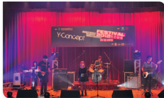
「Y-Concept 青年創作人計劃」—參加者於Y-Concept Mini Stage發佈他們創作的新歌。 'Y-Concept Young Creator Project' - youngsters released their own songs in Y-Concept Mini Stage.

Last summer, Jockey Club Youth Leap launched a youth participation project named 'Go I Can', which aimed at enhancing young people's social consciousness. The project theme was 'sub-divided flat (SDF) issue'. 35 participants experienced the daily life of SDF residents through paying home visits, case interviews, as well as having dinner together in 3 months. At the end of the project, they organised a thematic community exhibition, public seminar and signature campaign to arouse public concern on the SDF issue as a way to convey youngsters' view to the public.