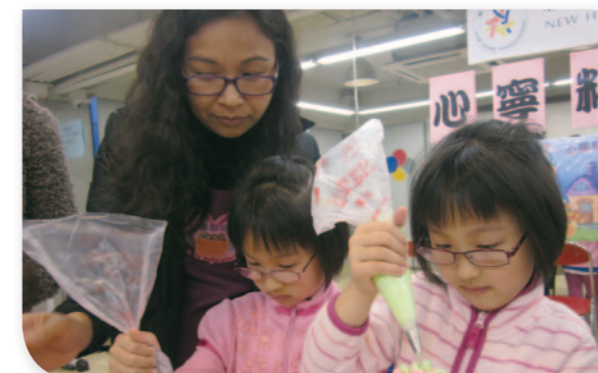
「心寧料理屋」的親子環節讓母親和子女一同享受入廚樂。 Mothers and their children made cupcakes in the parent-child section of 'Cook with Hope' Project.

Cooking may not be just a daily task, but also could be an interesting and stress management activity. Funded by Operation Santa Claus 2012, a project namely 'Cook with Hope' was launched in October 2013, aimed at enhancing stress management ability, family relationship and delivering message of 'Zero Tolerance to Family Violence' for the survivors and potential victims of domestic violence through employing a pioneer intervention approach of cooking therapy. The project consisted of therapeutic groups, educational talks, wild cooking day camps, cooking competitions, food carnivals, production of a short movie and movie screening, publication of book and a closing ceremony for service users of Serene Court and the community.