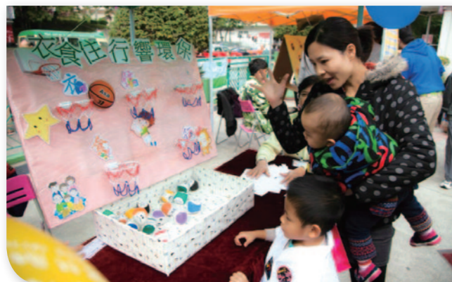
中心藉著環保攤位遊戲，向居民發送環保訊息。 'Green Life' game booth was held to convey environmental protection messages to the residents.

As a district-based integrated family service centre, Family Energizer (Integrated Family Service) understands the importance of community network in rendering service to local residents extensively and effectively. Last year, Family Energizer (Integrated Family Service) had good collaboration with local organisations, schools, local leaders and government departments in case referrals and community activities. With the support from Tsui Ping (South) Estate Management Advisory Committee and Wo Lok Estate Management Advisory Committee, Family Energizer (Integrated Family Service) mobilised volunteers to visit families in the community, which aimed at helping the 'hidden families' out as early as possible. Moreover, large-scale programmes were launched to convey environmental protection and harmonious family messages to the residents.