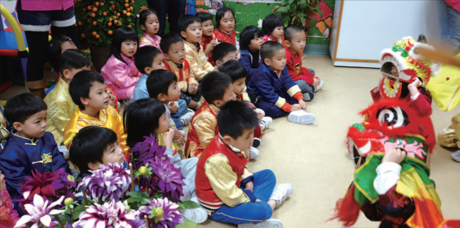
新春團拜活動 Lunar New Year activity