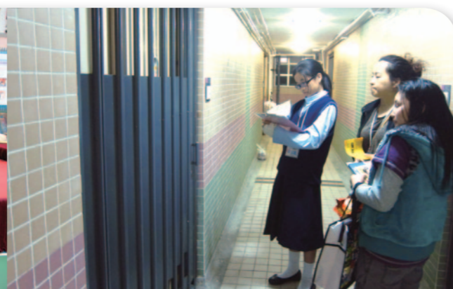
義工探訪翠屏邨。 Home visit at Tsui Ping (South) Estate by volunteers.