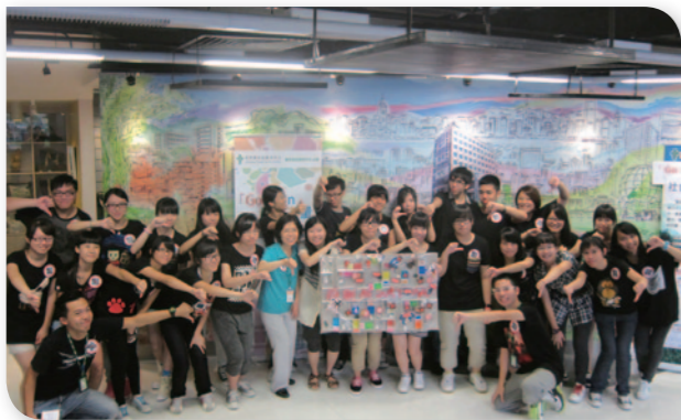
「Go I Can 青年力量」社會參與計劃啟動禮。 Kick-off event of the youth participation project named 'Go I CAN'.

去年暑假，賽馬會跳躍青年坊舉辦了「Go I Can 青年力量」社會參與計劃，培養年青人關心社會的意識。計劃以關注劏房現象為學習議題，35位年青人在為期3個月的計劃中，透過與劏房住戶訪談及一同煮食，學習體驗他們的生活。最後再以「向劏房 SAY NO」為題舉辦社區展覽、公眾分享會及簽名運動，向大眾呼籲關注劏房現象，向社會表達年青人的意見。